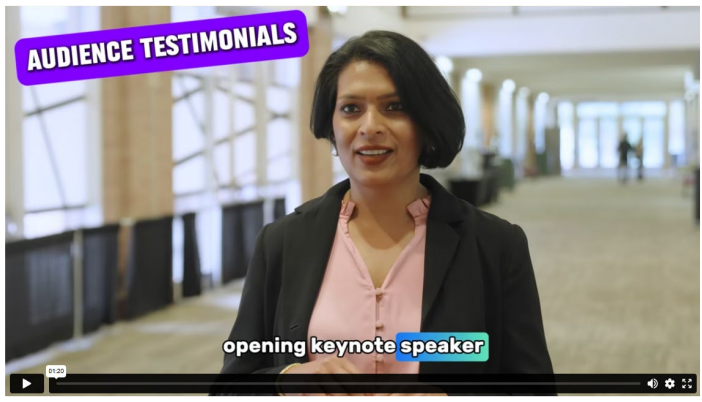
opening keynote speaker